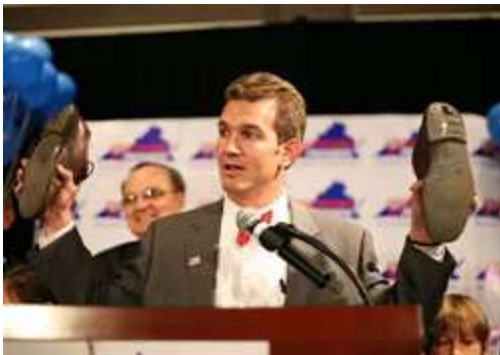
Chap Peterson, State Senator

Today's Program Chap Peterson State Senator